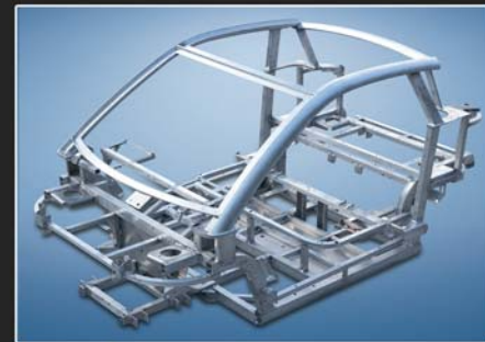
High Rigidity Aluminum Frame