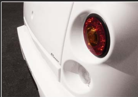
Rear Reverse Lights