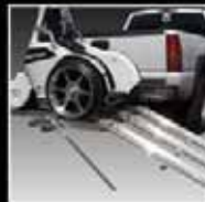
Hitch Mount Carrier