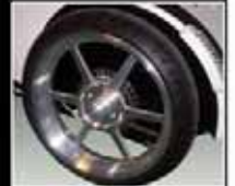
Hydraulic Disc Brakes