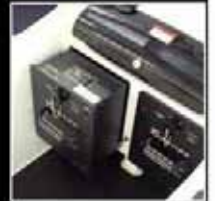
Swappable Power Modules