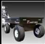
Multiple Trailer Options