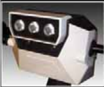
Adjustable LED Headlight