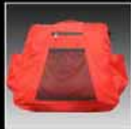
Red Pannier Bag