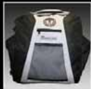
Black Pannier Bag