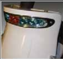
Integrated LED Lighting