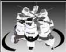
0-Degree Turning Radius